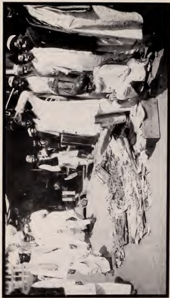
A small merchant of Baroda. Most of the articles for sale are of Western manufacture, such as scissors, combs, mirrors, etc.